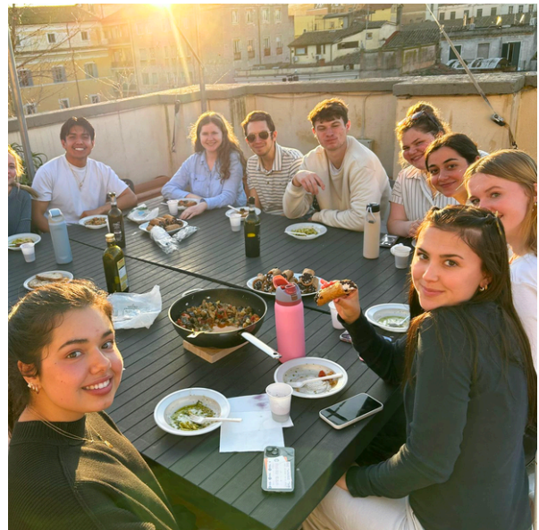
Students sharing a meal during Nutrition class.

Now that it's getting a little warmer out, our cooking classes can take place on the rooftop! Part of our Nutrition course incorporates practical cooking lessons that always end with a shared home-cooked meal, proving that Italian cooking is good for the body and soul. Buon Appetito!